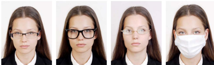
Glasses frame covers eyes

Photos in which part of the face is obscured